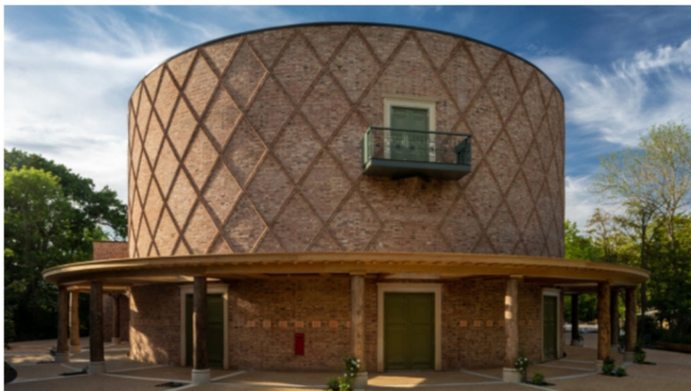
Theatre in the Woods at Grange Park Opera, Surrey